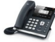
Yealink T4 series