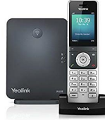
Yealink DECT Cordless